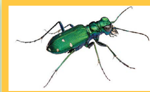
Six-spotted Tiger Beetle