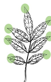
5 to Many Leaflets