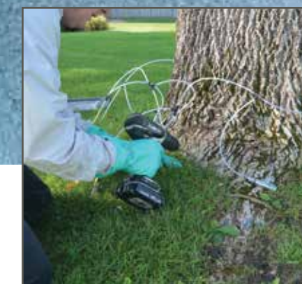
Small holes are drilled at the root flare of the tree. Tees are inserted and the system is pressurized to move the treatment into the tree.