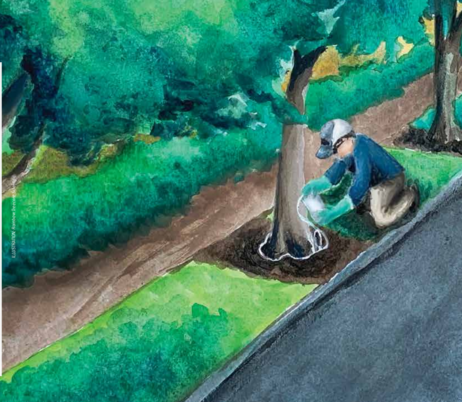
ILLUSTRATION: Rainbow Ecoscience Scientific

The larger the tree, the greater the benefits. Conversely, larger trees also require more resources for removal and disposal. This is the reason that preservation and protection should be focused on saving the larger, more mature trees in the urban forest.