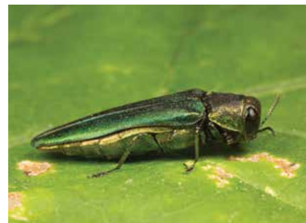
Although EAB is wide spread throughout the USA, it is not common to see a live adult in a tree.

Economic models have been developed that help predict the costs associated with different management strategies. Proper municipal EAB management is about minimizing financial burden while maximizing preservation of secondary tree benefits. In most cases, a tree can be protected for at least 20 years for the same cost of removal! Additionally, by preserving the tree, you are preserving all of those secondary benefits that would be lost with a smaller, newly planted tree.