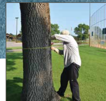
Mectinite treatments are dosed based upon the diameter of the tree at breast height. Each tree is individually measured.