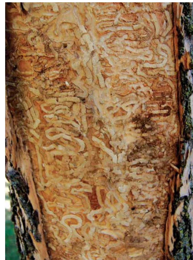
EAB kills ash trees as its larvae consume the water-conducting tissue beneath the bark

Emerald ash borer is deadly to ash trees because the larvae feed right under the bark. This is where a tree conducts water and nutrients from its root system up to the leaves. As the number of larvae increase, more of the tissue becomes damaged which blocks the flow of water and nutrients, thus resulting in tree death. Visual symptoms of an EAB infestation often take a few years to manifest themselves, thus adding to the challenge of effective management.