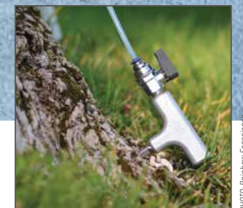
Each tree takes about 5-10 minutes to set up, and just a few minutes to move into the tree. Mectinite treatments protect the tree for at least 2 seasons.