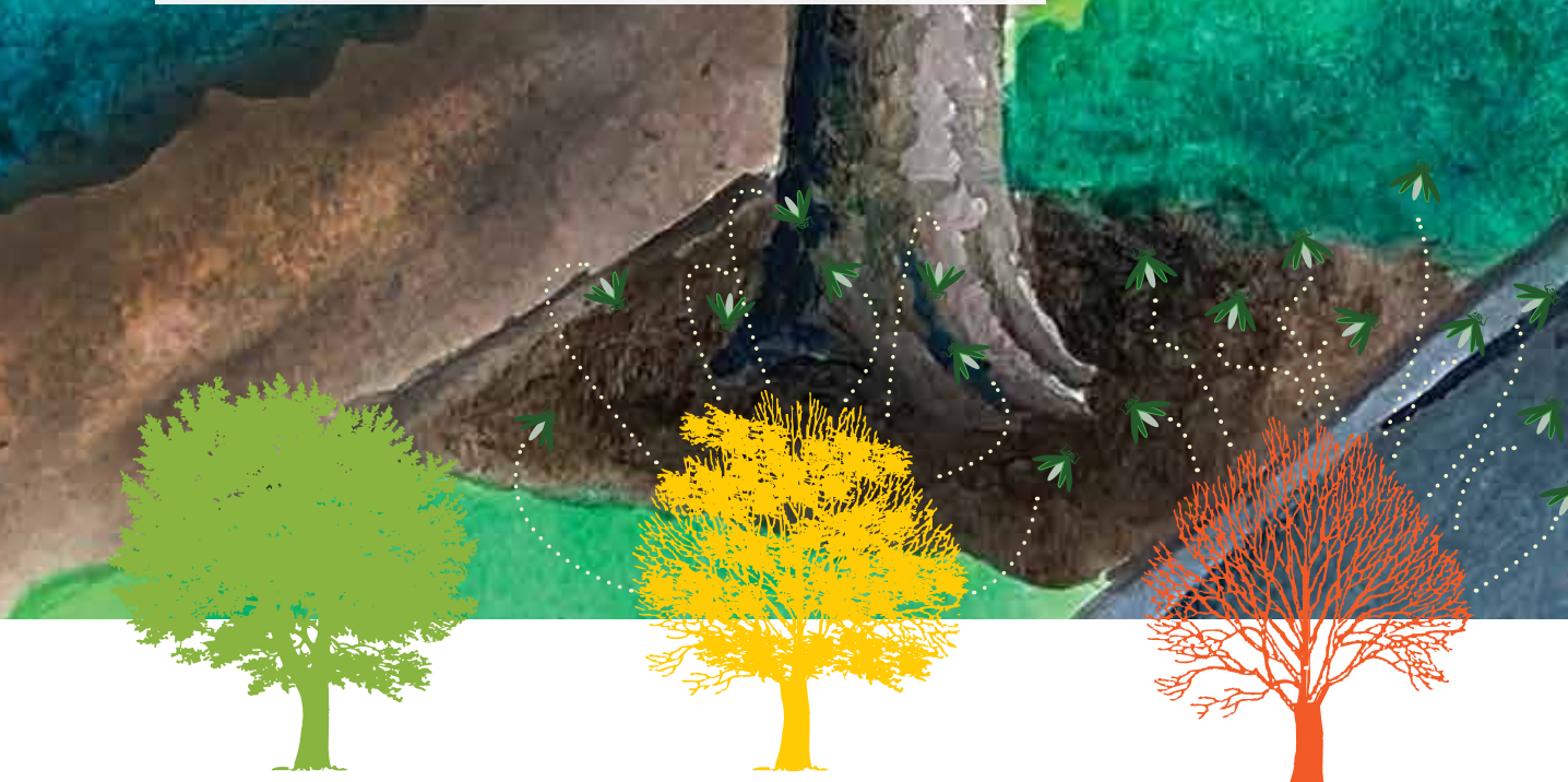
A healthy ash tree will transport water through the current year's growth ring.