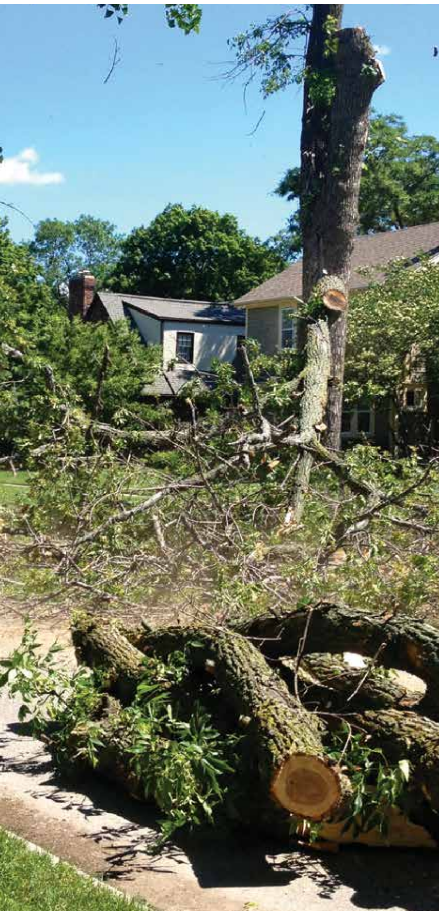
The loss of trees from emerald ash borer can have a significant impact on the neighborhoods it infests